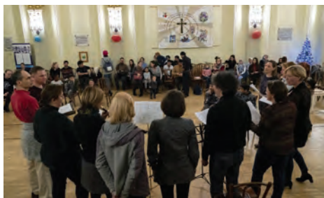
A gathering in St Columba CofS, Budapest