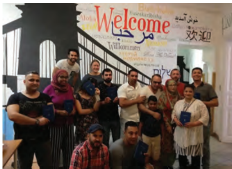
Kalunba Charity, group presented with certificates having completed Hungarian language course

We would love to hear from you if you would like further information or would be interested in getting involved in any aspect of our work. Already we have a growing number of our church members who donate clothes which are taken to DRS sorted and shipped out to refugee camps.